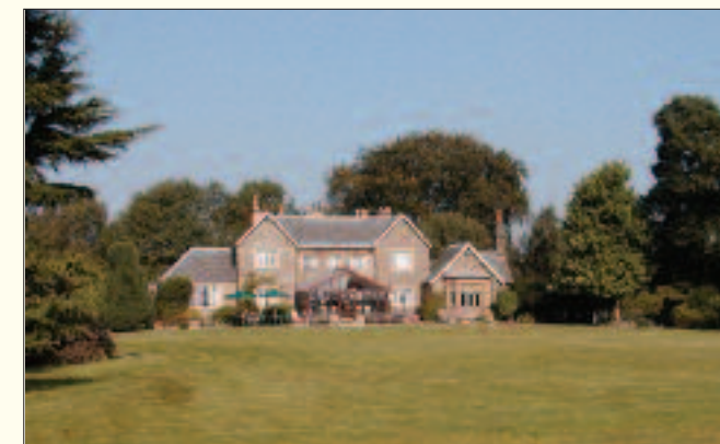
Priory Lane, Ulverscroft, Markfield, Leicestershire, LE67 9PH