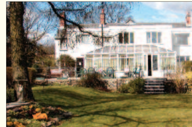
Whitwick Road, Ulverscroft, Markfield, Leicestershire, LE67 9QB Tel: 01530 244914